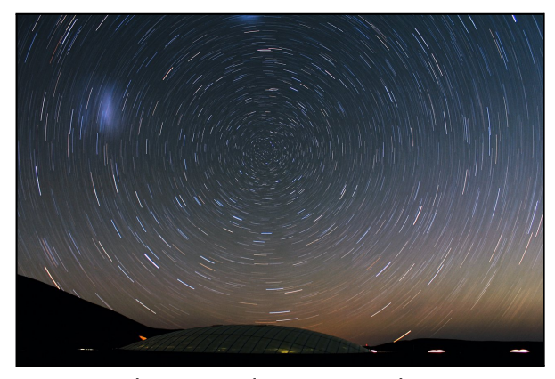
Photo credit: ESO/F. Char 30-minute exposure of the night sky over the European Southern Observatory's Paranal Observatory in Chile. Photo by Farid Char. https://www.eso.org/public/images/potw1313a/