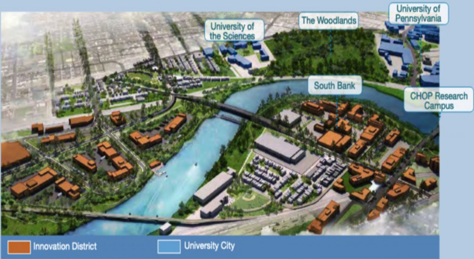
View of Innovation District looking north to University City