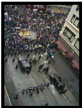
Don't let them box you in. Stay mobile and out of jail.

A demonstration where police might attack requires a higher level of tactical awareness than your run-of-the-mill picket. Here are some generally applicable suggestions to help you stay safe and effective in the streets.