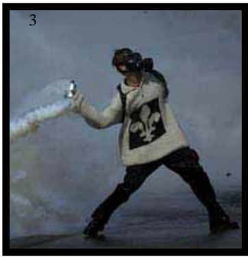
Tear gas canisters can be thrown away from the crowd, but be careful. They are extremely hot, and can burn your hands.

to intimidate and scare people away; Surprise attacks by troops hidden in reserve; Surround and Isolate Entire Crowds – Sometimes not allowing people to leave or enter.